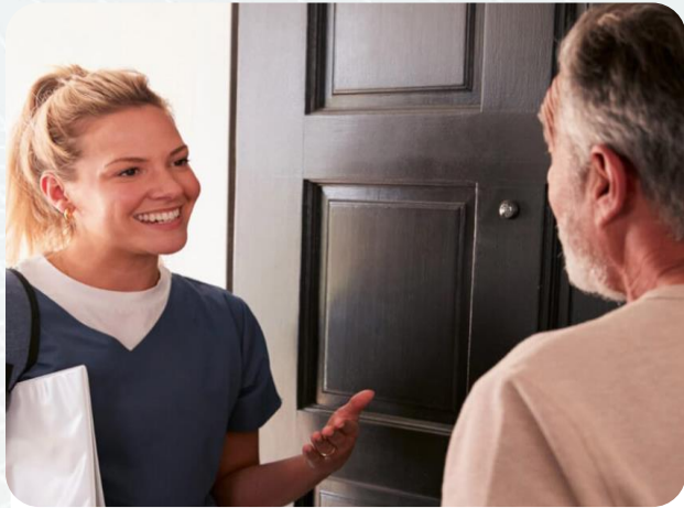
DETOX (4-7 Days)

Contact us for a full description of this service