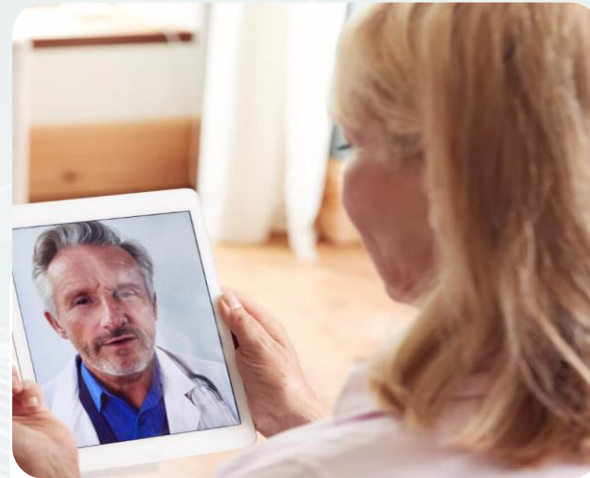
INTENSIVE TELEHEALTH (3 Months)

Contact us for a full description of this service